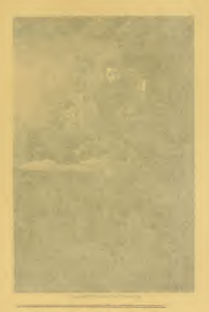
"'Take the money, -- the timber is mine'"