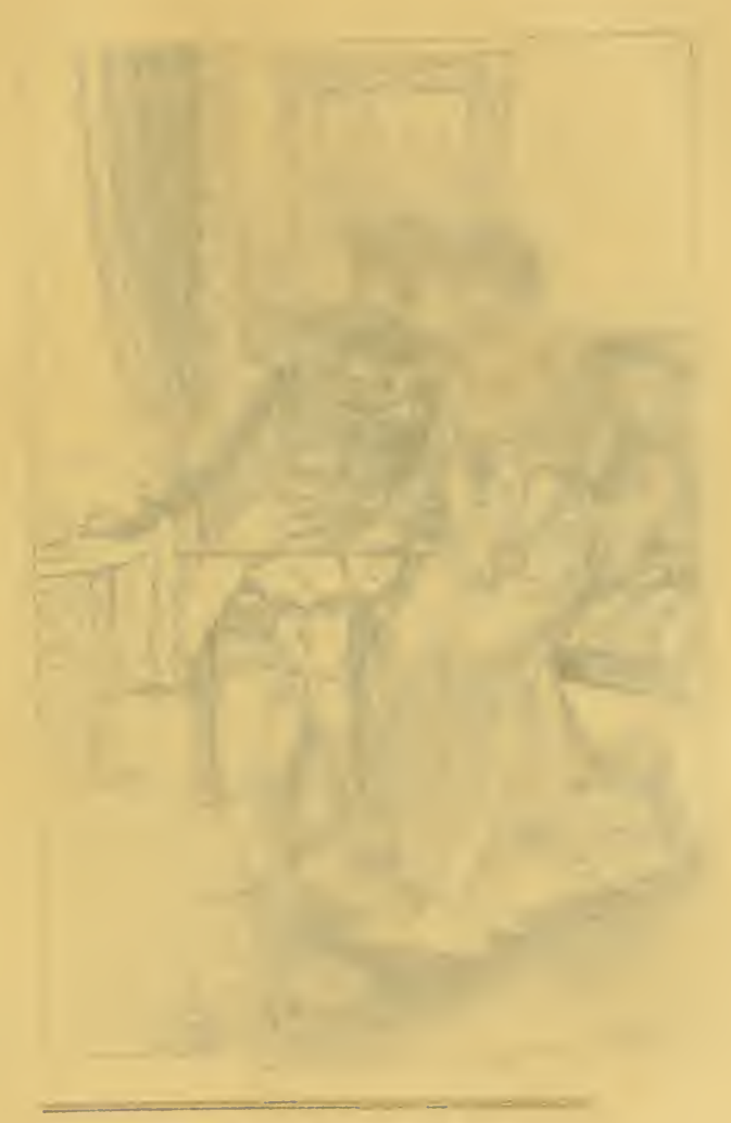
"It was not he, but she, who became embarrassed."