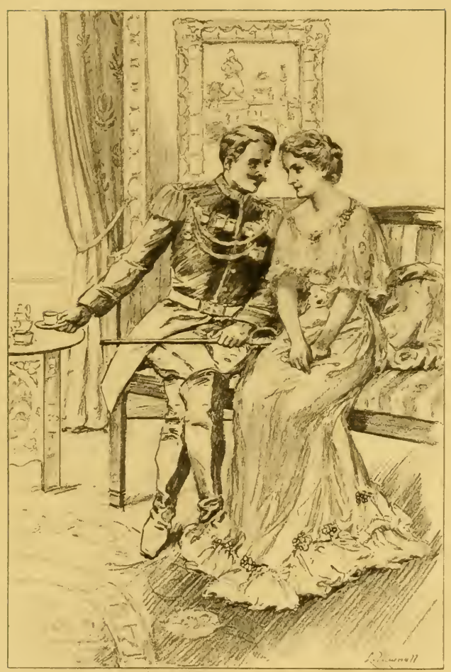
topproght MI - by Dana Estes & company