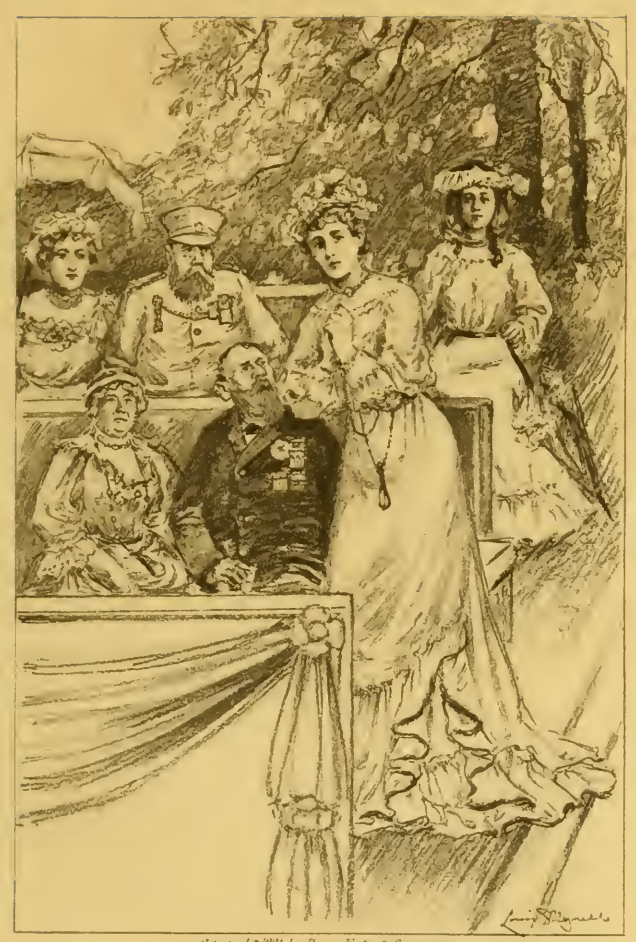
Company Dana Estes & Company