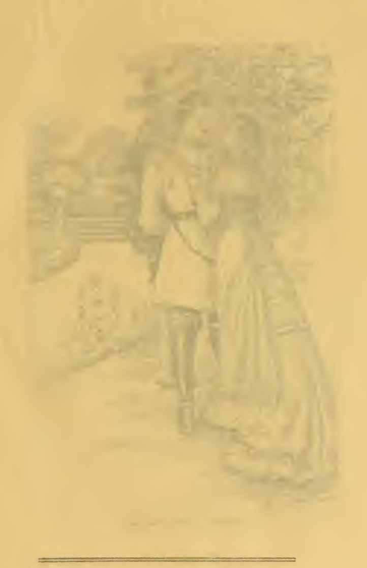
"'Always about the same!"" Photographic from Drawing by Louis Meynett